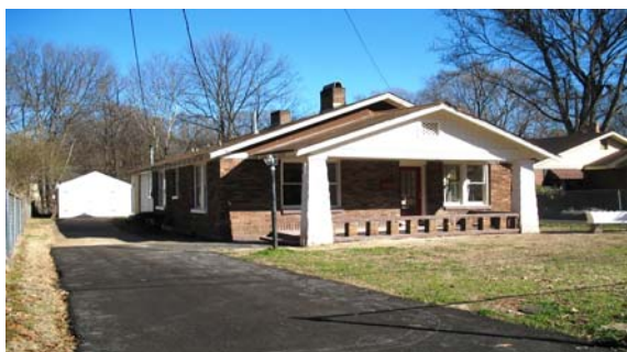
540 Josephine - $75,000.00 3 Bedrooms & 2 Full Baths

Some recent volunteers to the Jacob's Ladder ministry are from The United Methodist Disaster Relief Team. In combination with their efforts and volunteer teams already in place, Jacob's Ladder is continuing to make inroads in the Beltline community. We are placing the final touches on two more homes which have been totally renovated and are currently for sale.