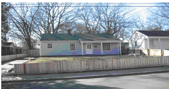
429 Buntyn St. - $68,000.00 3 Bedrooms & 1 Bath

Without the dedication of time and skills and generosity of spirit offered by this wonderful group of volunteers led by new JLCDC Board Member, Byron Crain, the restoration of these homes would not be possible.