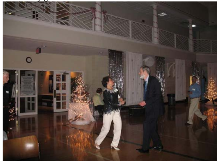
They didn’t exactly dance the night away, but many who attended the annual gala did enjoy a turn or two on the dance floor.